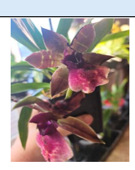
Propetalum La Jolla 'Hilo Orchid Farm' AM/AOS Mai Conaway