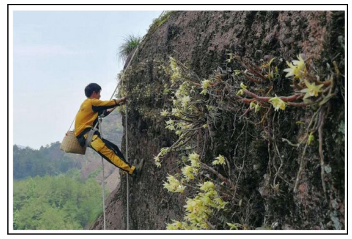
Planting orchids on a cliff in Fujian province, southern China.