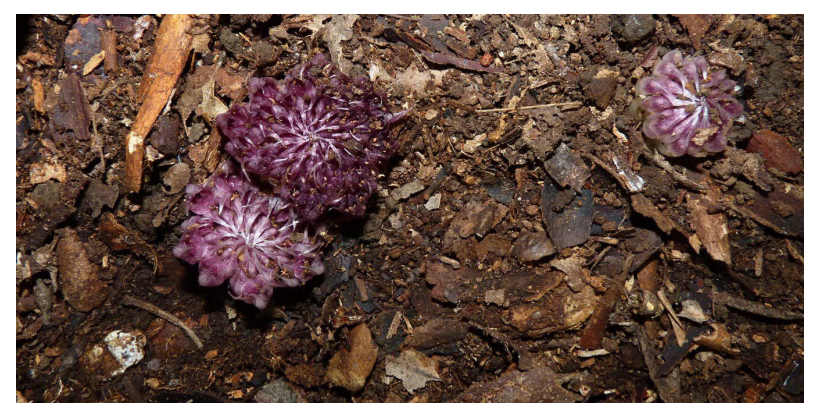
Rhizanthella speciosa from Barrington Tops. Credit: Mark Clements

We've seen accounts of underground orchids before, but this is from down under. You can find it at the following url: <a href="https://phys.org/news/2020-12-life-mars-underground-orchid-australia.html">https://phys.org/news/2020-12-life-mars-underground-orchid-australia.html</a>. Who knew bandicoots were important to orchid propagation?