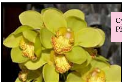
Cymbidium Kousho Dream 'Irish Sky', FCC/AOS

Register now! https://attendee.gotowebinar.com/register/4165038377520489473