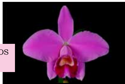
Cattleya pumila 'Pure Bliss', AM/AOS

Register now! https://attendee.gotowebinar.com/register/8841387774699307521 After registering, you will receive a confirmation email containing information about joining the webinar.