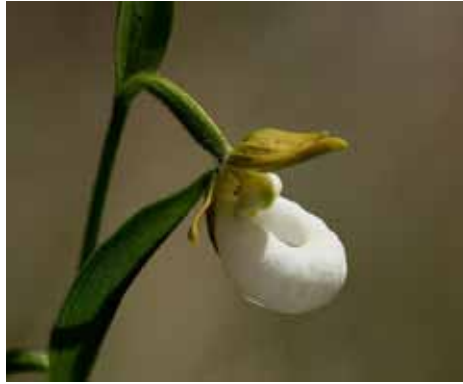
Cypripedium californicum

Clearcutting damages the plant not only by changing stream flow patterns and introducing the risk of trampling but also by allowing more sunlight into the forest,