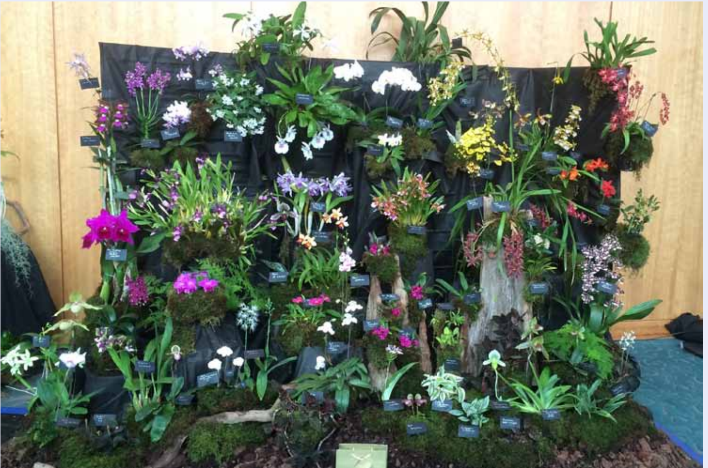
Maryland Orchid Society installed the Best Society Exhibit and won the Orchid Digest Trophy for the Best Amateur Exhibit in the show.