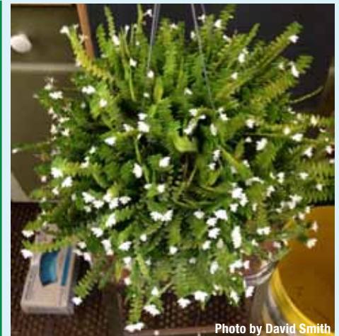
November, 2013 blooming of Angraecum distichum 'Aubert Wines' CCE/AOS

This plant might prove to be a big challenge for growing on a windowsill, but would possibly be worth trying in a more