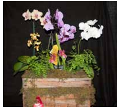
The Dagostins' exhibit