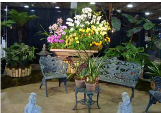
The Little Greenhouse's Display