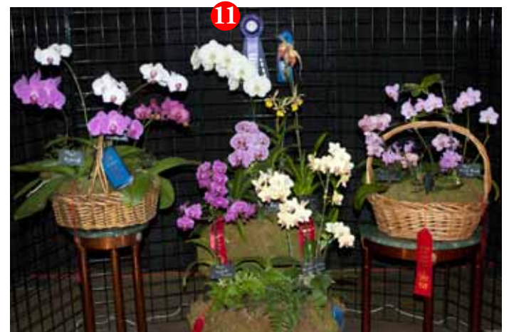
The Soykes' exhibit