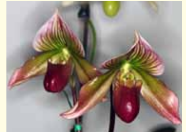
Paphiopedilum and Phragmipedium —Paph. (Hsinying Inspiration X Sue Franz) - Phuong Tran & Rich Kaste