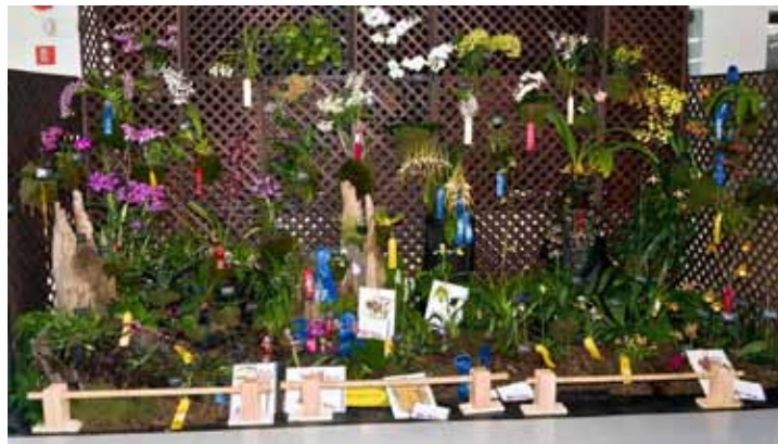
MOS exhibit for the 2011 NCOS Show.