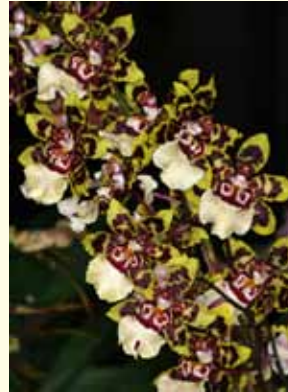
Oncidium —Colm. Wild Willie - The Adamases