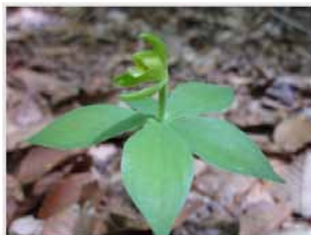
All orchids require fungi at some point in their lives, but the small-whorled pogonia requires it always. It is a parasite on the fungus, which itself has a symbiotic relationship with certain trees. Thus, in a sense the pogonia is a parasite on both the fungus and the tree.

The small-whorled pogonia has a single grayish-green stem that grows about 10 inches tall when in flower and about 14 inches when bearing fruit. The plant is named for the whorl of five or six leaves near the top of the stem and beneath the