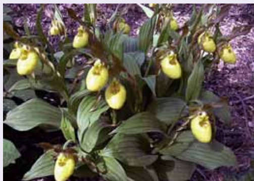
Cypripedium pubescens 'Vigrous' for Clark Riley's Web site. http://www.cyps.us