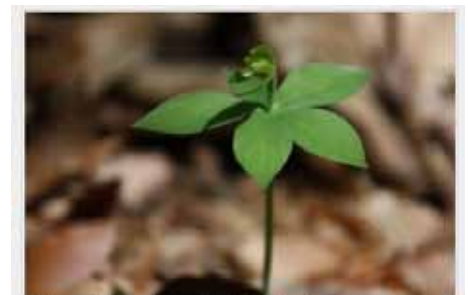
Isotria medeoloides is considered a threatened species.