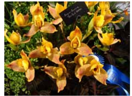
The Little Greenhouse's Angest. Aurora 'Harford' AM/AOS from the 2010 show.