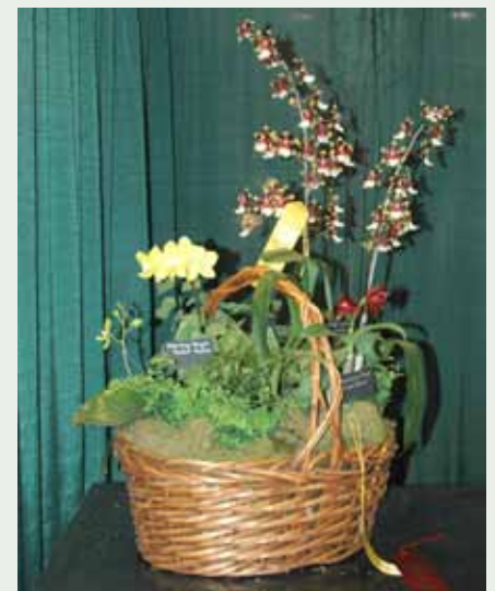
Patty Kelt's 2010 Exhibit