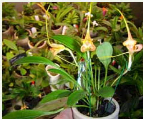
Photo of Masd. norop

The title of the talk is: Succeeding With Cool Growing Orchids in Warm Climates.