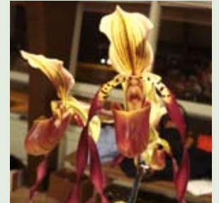
Paph. Berenice - Phuong Tran & Rich Kaste