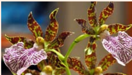
Zygo. ( mackayii X Titantic ) - Cy Swett