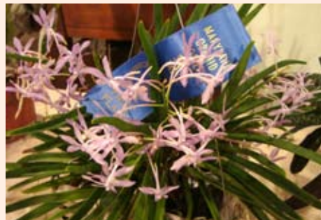
Dar. Charm 'Pacific Blue' - Craig Taborsky