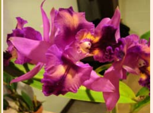
Blc. Mary Hurland 'Hawaii'