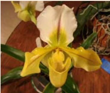
Paph. (Yerba Buena X Caddiona) - Gregg Custis