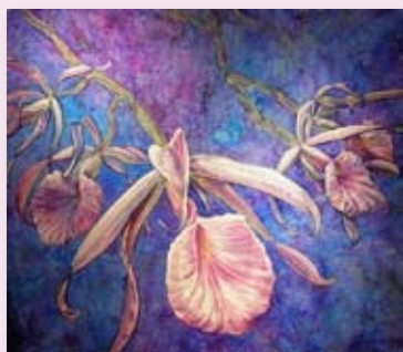
Windswept Brasso by Patricia Laspino

(Images are from the Chasen Gallery web site— http://www.chasengalleries.com/laspino/index.html )