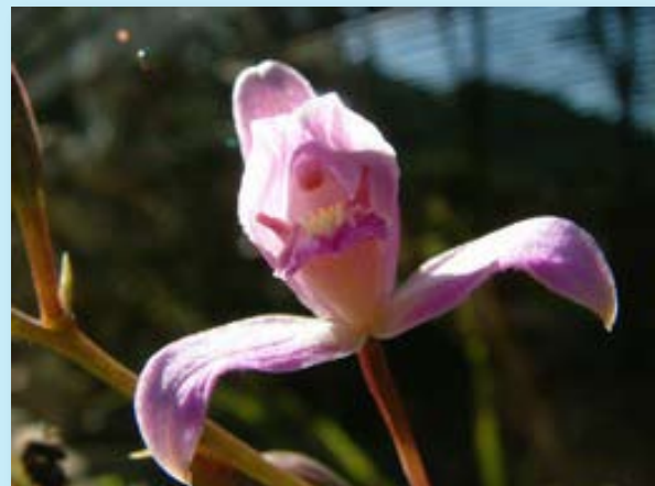
Bletia purpurea

Quarter Acre Orchids 2804A Sherwood Hall Lane Alexandria, Virginia (703) 328-9929 (703) 780-2858 (shop) email: Info@quarteracreorchids.com