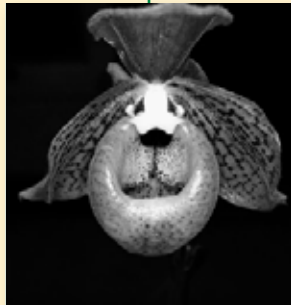
Last year, Sarah Hurdel's photo won first place in the black and white photography category.

to do so from arranging 3 plants, to 100 square feet of exhibit space and everything in between. Get with a friend or make a new one and exhibit together. The possibilities are endless. Show off your artistic talents as well. We will again this year be offering space to Orchid Society members to exhibit their work in photography, drawing, paintings and more.