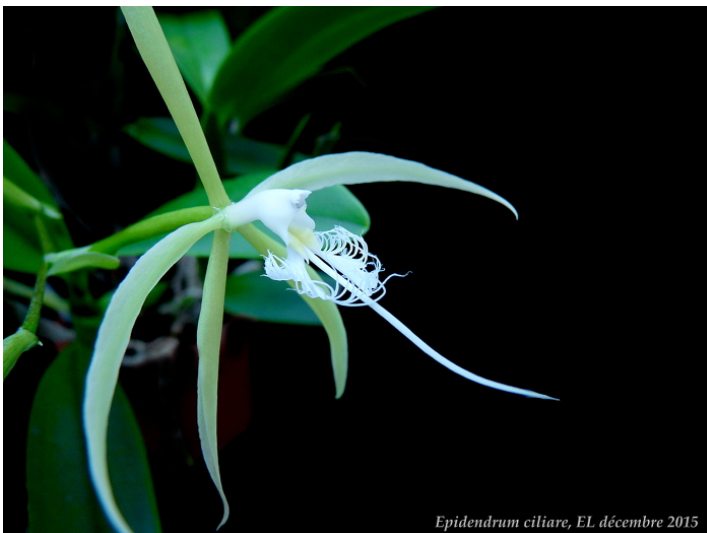
Epidendrum ciliare, EL décembre 2015