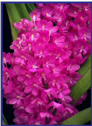
Good cultural practices that include regular fertilizing will produce well-flowered orchids, such as this Vanda ampullacea ( Ascocentrum ampullaceum ) Grower: Greg Allikas and Kathy Figiel. Vandaceous orchids that were under fertilized (left) and received adequate fertilizer (right).

There are also many secret recipes growers use that supposedly produce stronger plants or more flowers. Certainly, vitamins and micronutrients are as essential as the building blocks of plant growth mentioned above. Elements such as magnesium, boron, calcium, carbon and others are required for strong plant growth. All in all, although there are certain practices that are documented as being helpful, it has not been proven that supplements actually contribute to improved growth in orchids — but it probably doesn't hurt to use them.