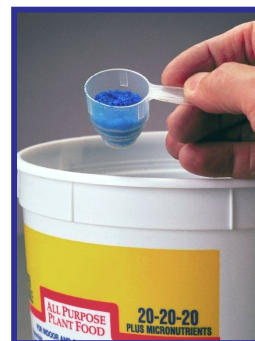
Most experienced growers use fertilizer at ½ the label-recommended strength.