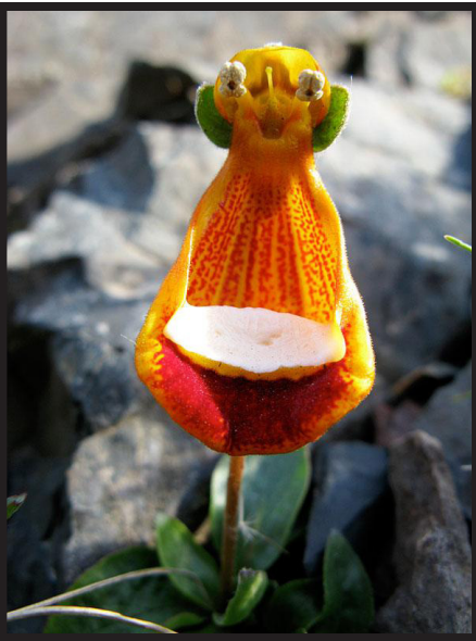
Happy Alien ( Calceolaria uniflora )