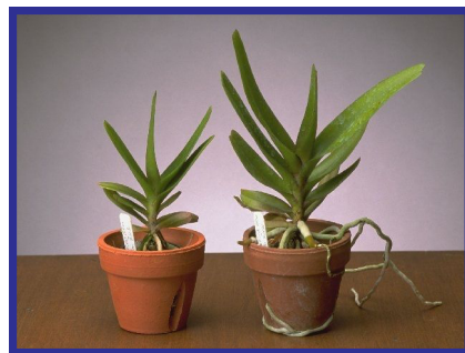
Vandaceous orchids that were under fertilized (left) and received adequate fertilizer (right).