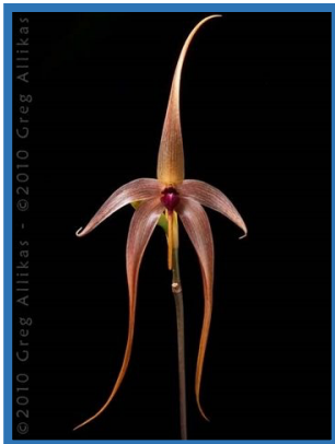
Bulbophyllum echinolabium 'Springwater' HCC/AOS; Photographer: Greg Allikas

Register now using this link: https://register.gotowebinar.com/register/4407180542545159939