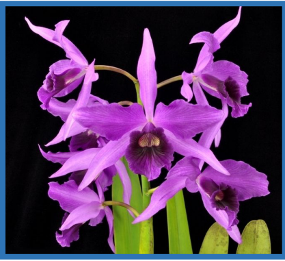
Cattleya purpurata (hort. var. rubra) 'Shoguns Fire' FCC/AOS; Photographer: Glen Barfield