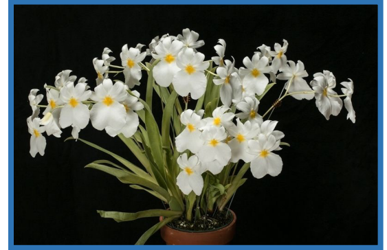
Miltoniopsis vexillaria var. alba 'Princess' CCM/AOS; Photographer: Alexey Tretyakov