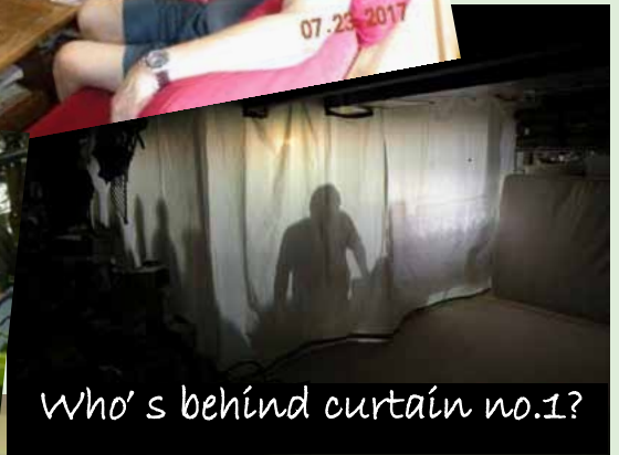
Who's behind curtain no.1?