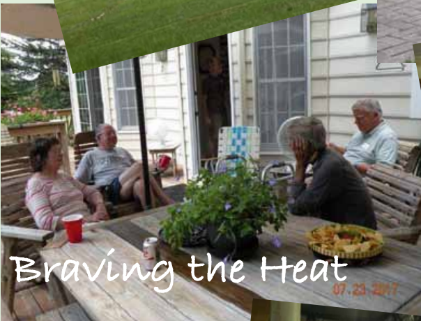
Braving the Heat