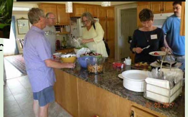
Lots of great food!