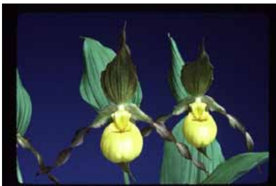
Cypripedium calceolus v. pubescens 'Golden Gem' AM/AOS; Photographer: Unknown