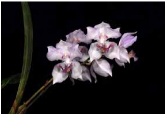
Aganisia cyanea Waterford' HCC/AOS; Photographer: Maurice Marietti

16-page award gallery of breathtaking pictures of recently awarded orchids.