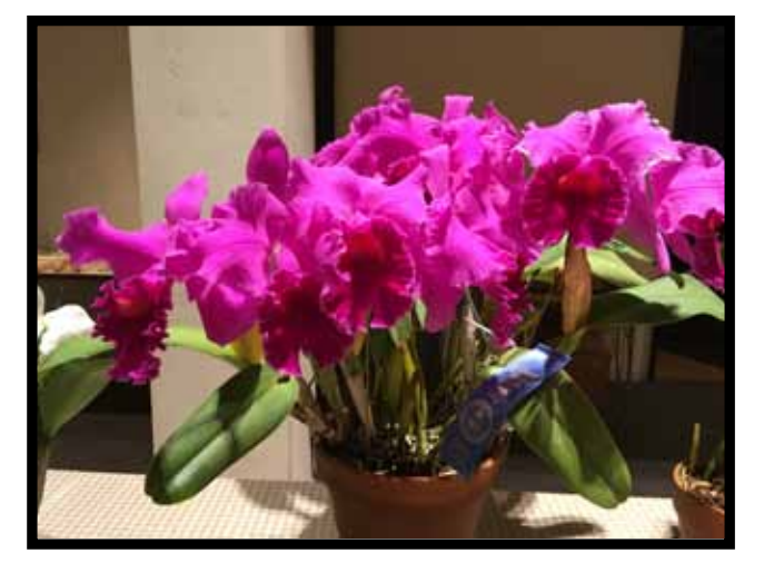
Blc. Mem. Grant Eichler 'Lenette' HCC/AOS

This orchid is an easy Cattleya to grow if you can give it the proper amount of light. This Blc. is what's called a standard Cattleya and grows to a specimen plant fairly quickly.