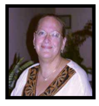
Submitted by Valerie Lowe - Away Show Chair.

Let's grow together, Denise Lucero http://aos.informz.net/aos/data/images/20001836.jpg