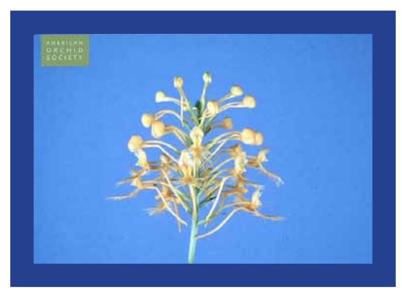
Platanthera ciliaris 'Rattlesnake Master' CBR/AOS; Photographer: James McCulloch