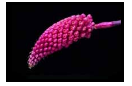
Robiquetia cerina 'Purple Pinecone' AM/AOS