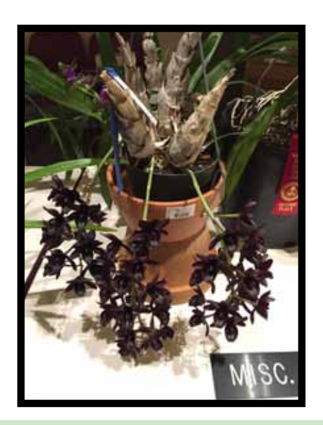
Fdk. After Dark 'SVO Black Pearl'

display of 112 beautiful flowering plants. A special THANKS to all that make our show table such a great success!