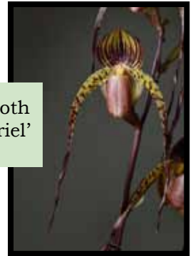
Paphiopedilum Adding Booth 'Gabriel'