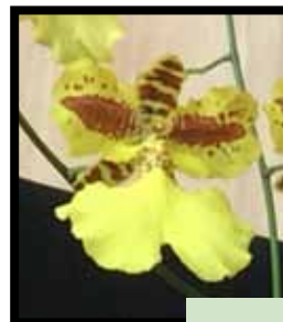
Oncidium Memoria Harold Starkey 'Loch Raven'