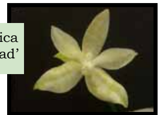
Phalaenopsis hieroglyphica frma flavum 'Hampstead'