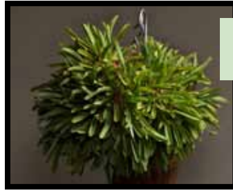
Speklinia tribuloides 'Flore Cuprum'

The Little Greenhouse plant of Oncidium Memoria Harold Starkey 'Loch Raven' was awarded an 80 point AM.