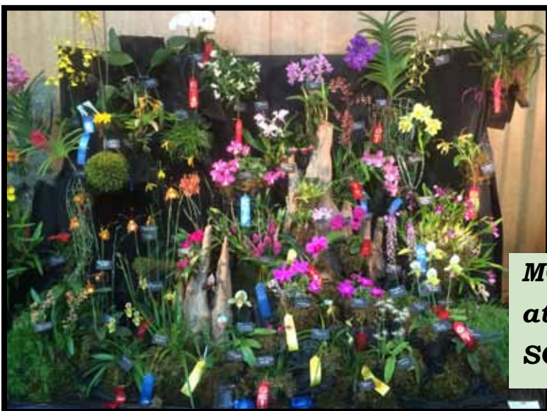
MOS Display at the SOS Orchid Away Show