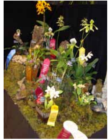
Owen Humphrey's exhibit