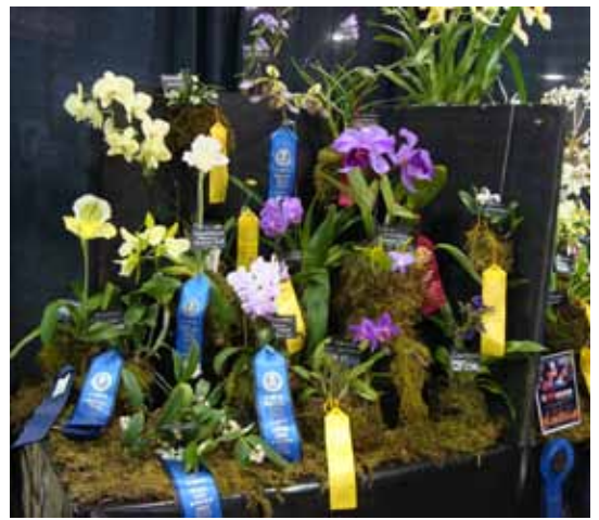
The Dagostins' exhibit