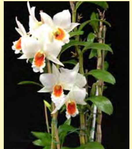
Dendrobium Judith Nakayama 'Go Ravens'