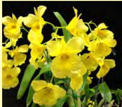
Dendrobium Golden Aya 'Mem. Benigna Venturina'