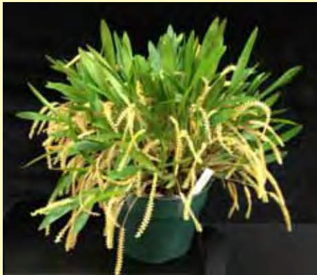
Dendrochilum pulcherrimum 'Paula Hermelyn'