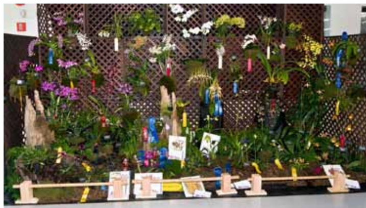
MOS exhibit for the 2011 NCOS Show.