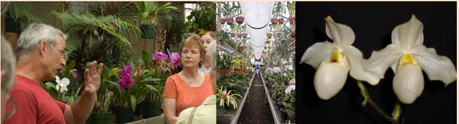
Photos from the 2009 open house