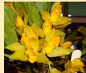
Lyc. aromatica, Cy Swett's first place fragrance class win on the June show table.