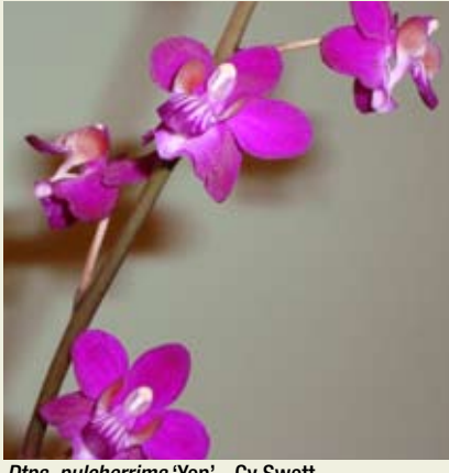
Dtps. pulcherrima 'Yen' - Cy Swett