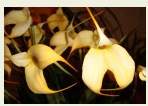
Masd. Aquarius - Jos Venturina