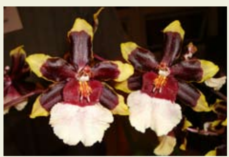
Colm. Wildcat 'Rainbow' - Phuong Tran & Rich Kaste