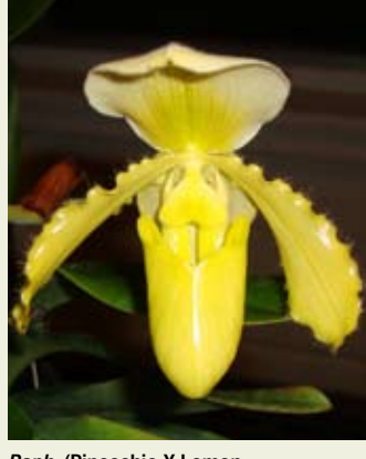
Paph. (Pinocchio X Lemon Celebration) - Les Kirkegaard