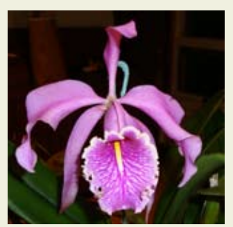
C. maxima - Gene Trump