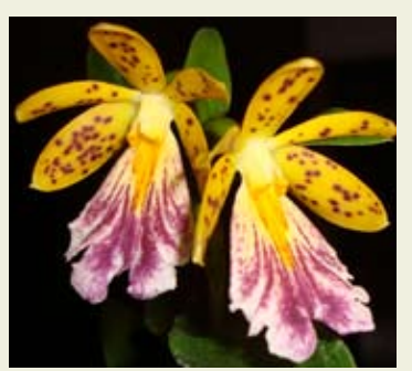
Oerstedella wallisii