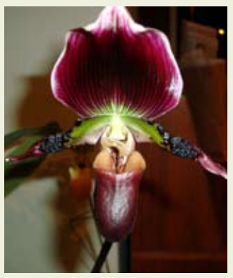
Paph. (Supersuk X Raisin Pie) - The Lundys