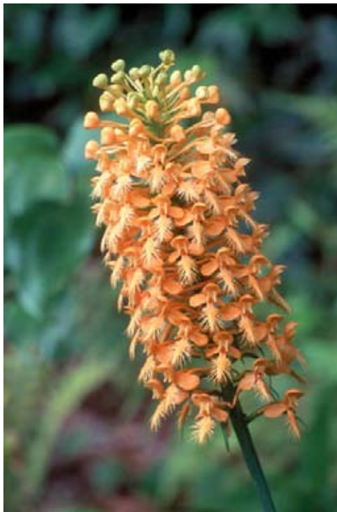
Yellow Fringed Orchid ( Platanthera ciliaris )