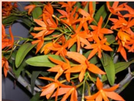
Lc. Chit Chat 'Tangerine' HCC/AOS - Les Kirkegaard