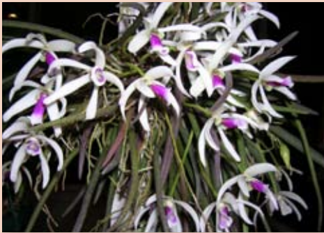
Lept. bicolor - Bill Scharf