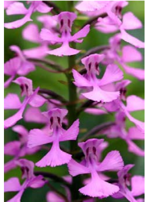
Purple Fringeless Orchid (Platanthera peramoena)

Come explore a new region with us and enjoy the fellowship of other orchid enthusiasts. We hope to see you in July!