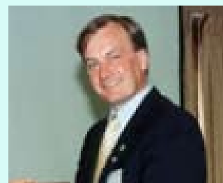
Photos from the Hatfield Orchids web site