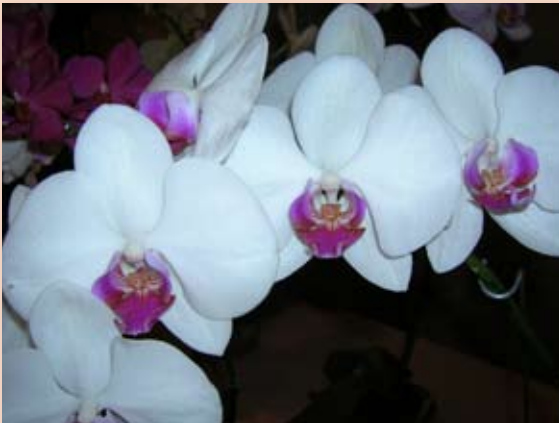
Phal. Hybrid - Shirley Tighe