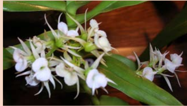
Ononiella polystachys - Craig Taborsky