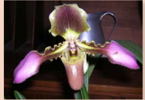
Paph. hirsutissimum var. esquirolei 'Goodwood' AM/AOS - The Lundys