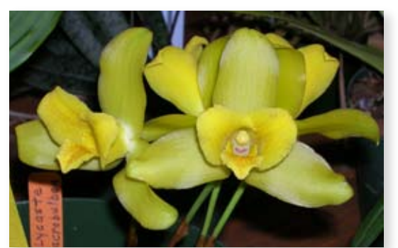
Lvc. macrobulbon - Bill Ellis