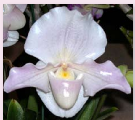
Paph. (Inca Brass X Freckles) - Ernie Drohan