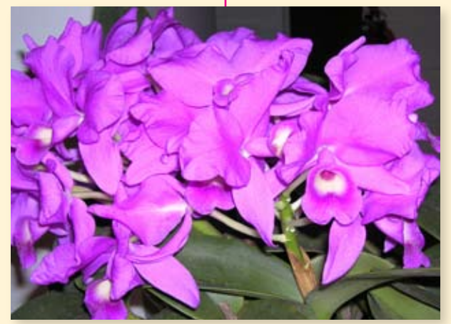
C. skinneri 'Casa Luna' AM/AOS - Ernie Drohan

users of the classification system. New data has mandated changes in orchid names, but the changes need to be compatible with the needs of the end users.