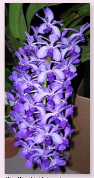
Rhv. Blue Lightning - Les Kirkegaard