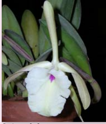
B. glauca - Cy Swett