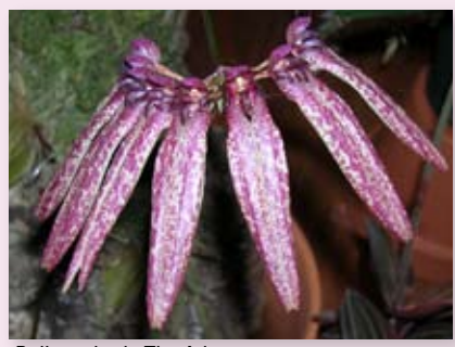
Bulb. weberi - The Adamses