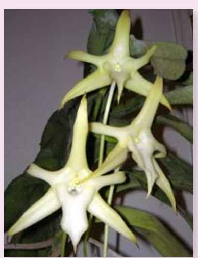
Ang. sesquipedale - Les Kirkegaard